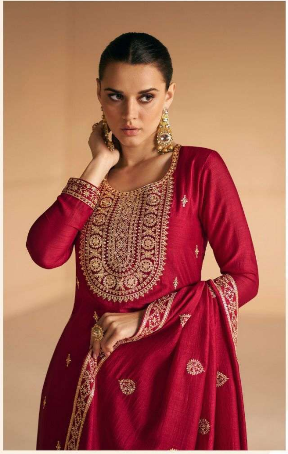
A - 9722