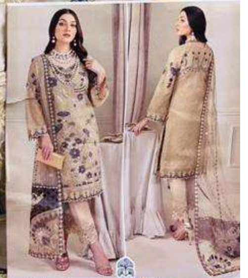
Ramsha Vol-9 TOP: Faux Georgette with Embroidery BOTTOM-INNER: Dull Satbon DUPATTA: Net ZAHA D.No. 10124