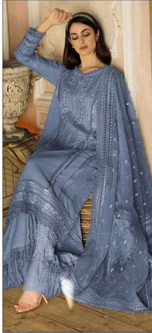
S - 137 F