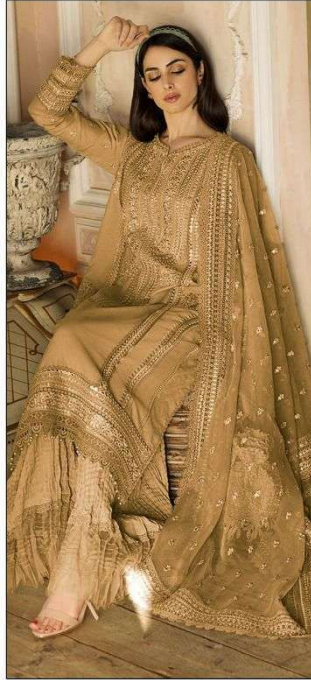
S - 137 G