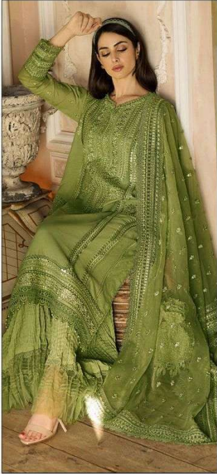
S - 137 E