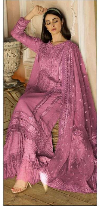
S - 137 H