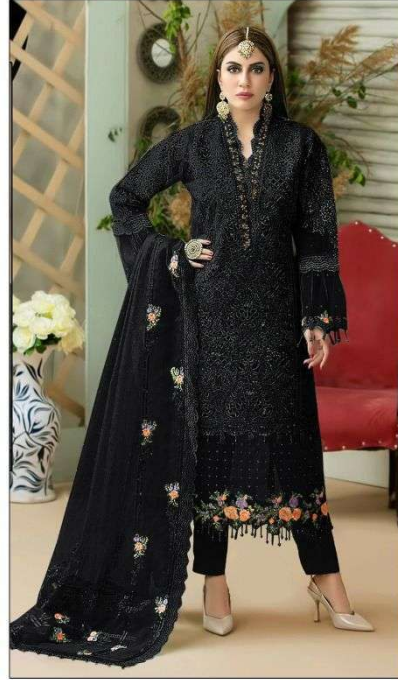
S- 72 J