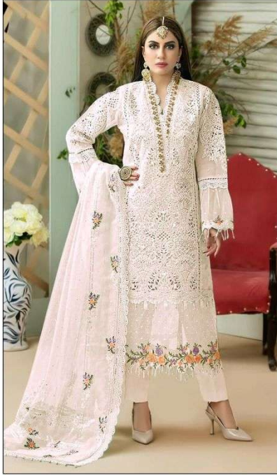
S- 72 I

Top - Butterfly Net Heavy Embroidered Inner Bottom - Heavy santoon Dupatta - Butterfly net heavy embroidered