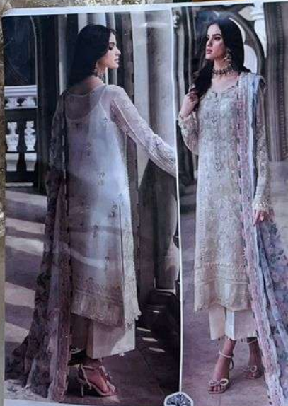
GULAAL VOL-1 TOP Faux Georgette with Embroidery ZAHA DUPATTA Dull santoon D.No.1