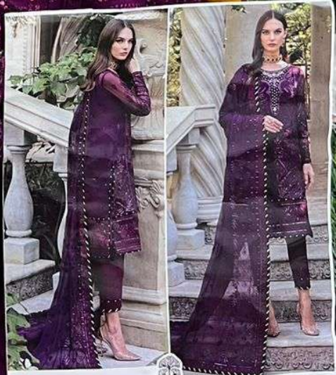
GULAAL VOL-1 TOP Faux Georgette with Embroidery ZAHNA DUBAI DUBAI D.No.10144 Nazmin with Embroidery