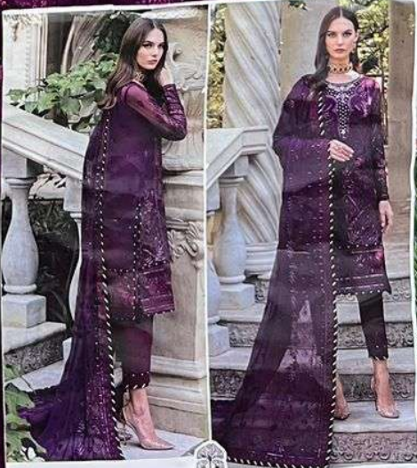
GULAAL VOL-1 TOP Faux Georgette with Embroidery ZAHNA DUBAI DUBAI D.No.10144 Nazmin with Embroidery