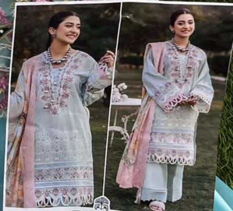
ALAYNA ZAHA D.No.10170 TOP Cambric Cotton With Heavy Embroidery Work BOTTOM-INNER Semi Lace DUPATTA Tubby Silk With Print