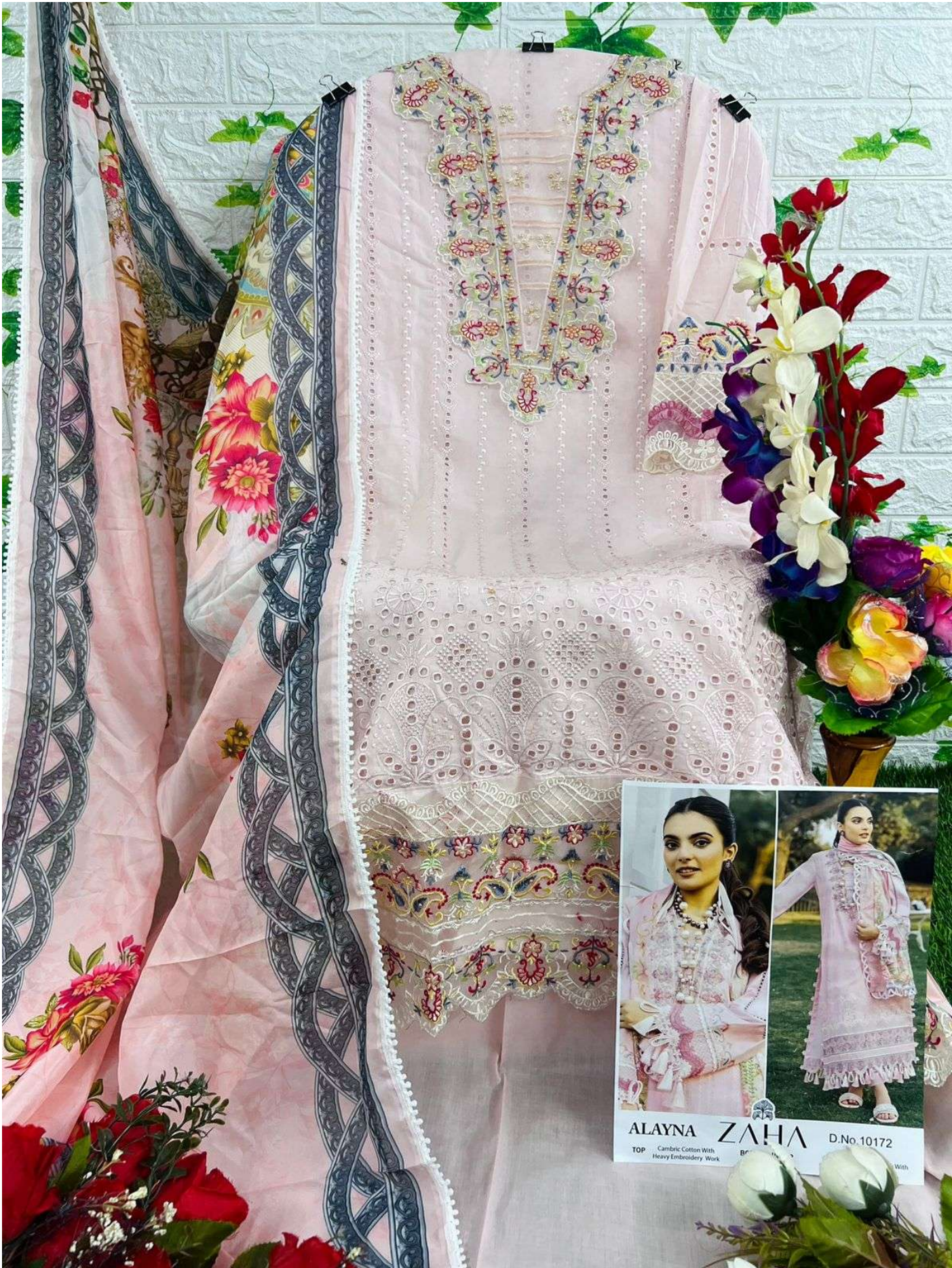
ALAYNA ZAHA D.No.10172 TOP Cambric Cotton With Heavy Embroidery Work