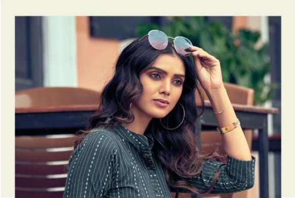
designs that will make you feel amazing