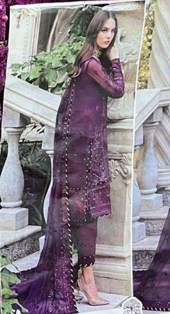
GULAAL VOL-1 TOP Faux Georgette with Embroidery ZAN BOTTOM