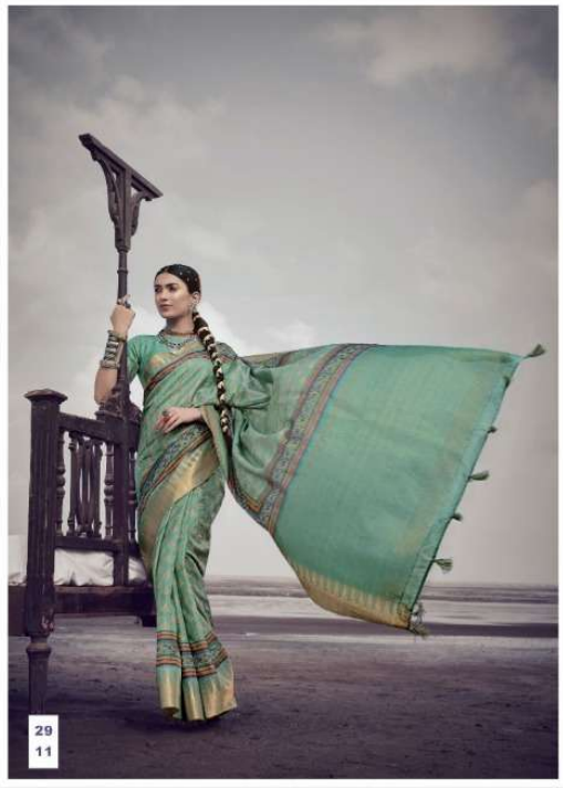
AS SERENE AS THE NATURE