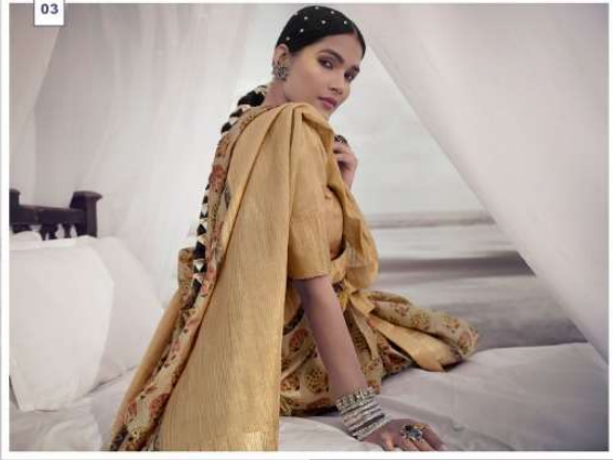
AS RADIANT AS THE SUN