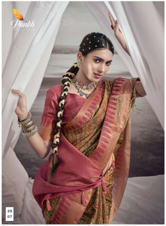
AS-FRESH AS THE BREEZE