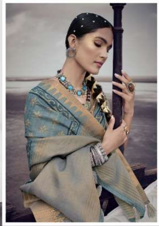
AG-SOOTHING AS THE NATURE