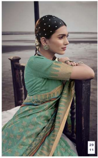
AS SERENE AS THE NATURE