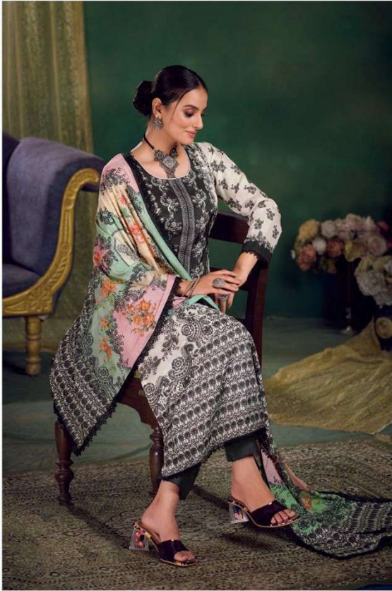
TREND Valour Cocktail glamour gate on ethnic edge