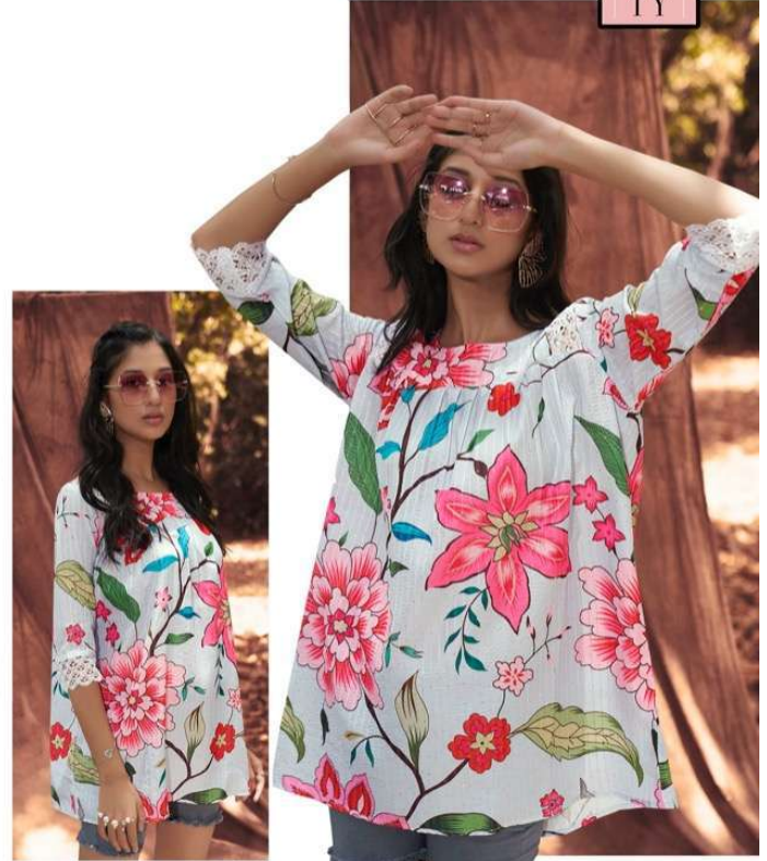
"When the grace and culture abook bando, kurti was born!" d.no.1004