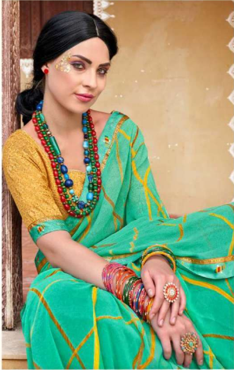
A TUNIC, WHICH IS AN EXAMPLE OF ARTFUL THREADS, MADE OF FIBER TURN OUT INTO LINEN FABRIC. TRENDY ELEMENTS DESIGNED WITH VIBRANT COLORS IN FRONT WITH HIGH LOW CONCEPTS MAKES YOUR PERSONALITY MORE CHARMING.