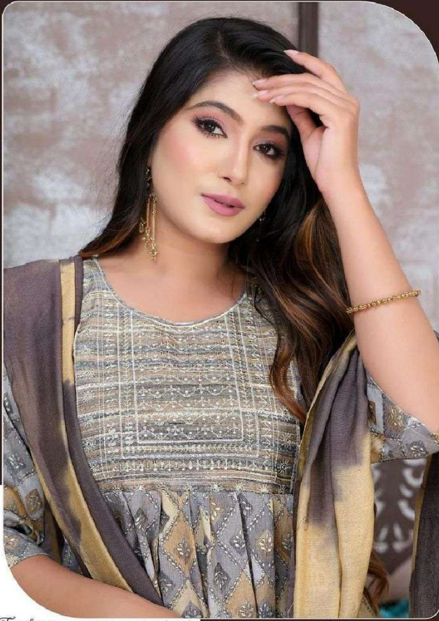
Fashion is very imperjanj.