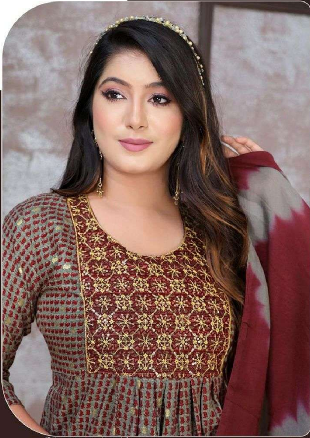
Fashion is part of our culture, and it's about more than just a pretty dress.