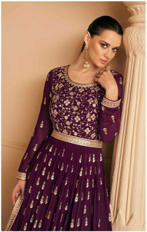
A - 9655