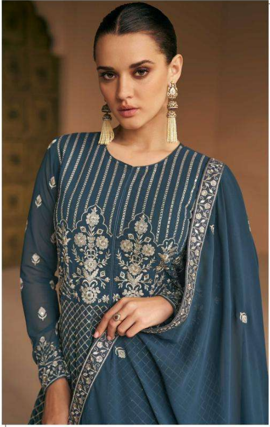
A - 9656