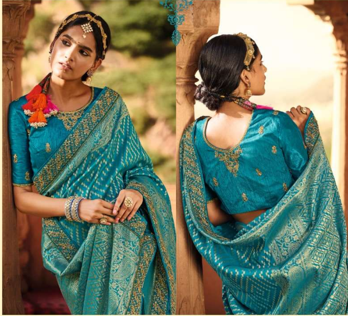
D.NO : - 2107