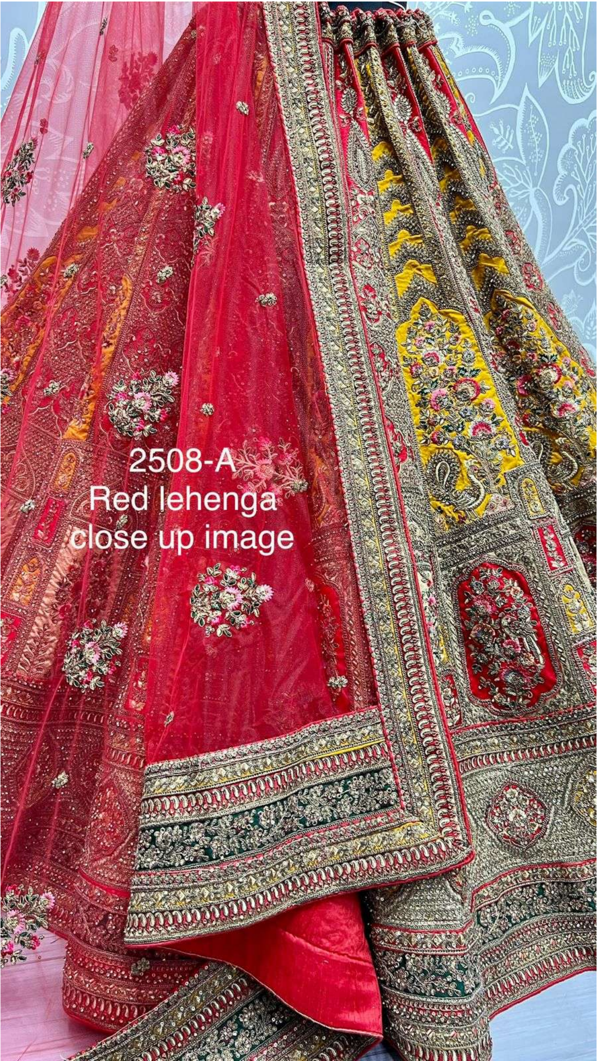
2508-A Red lehenga close up image