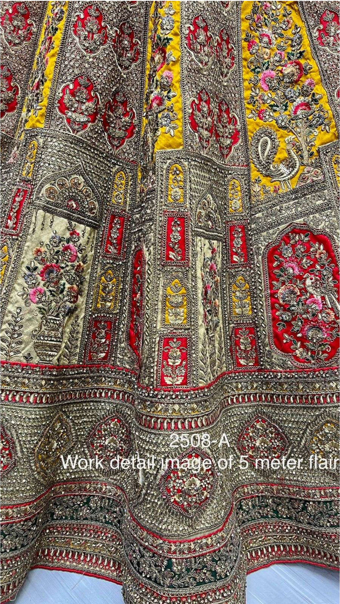
2508-A Work detail image of 5 meter flair