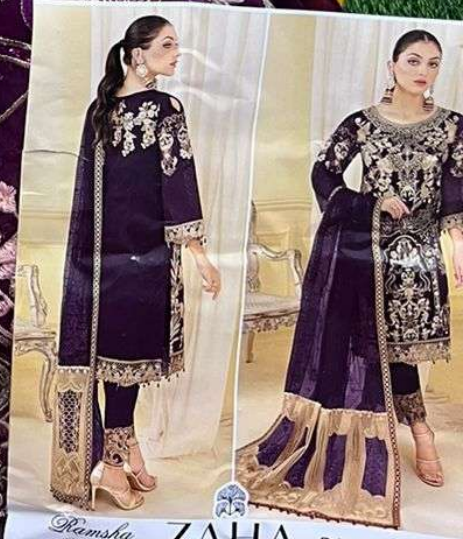
Ramshu TOP ZAHA D.No.10125-B DUPATTA Net