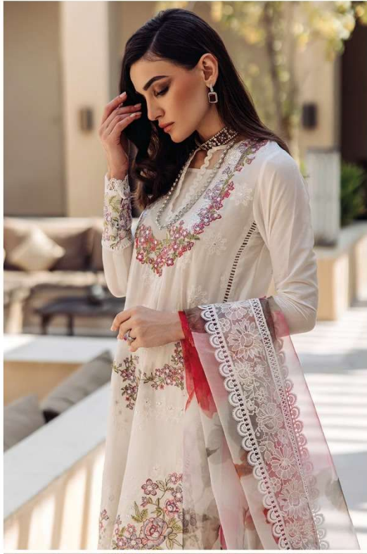
BEAUTY & THE BEAST I love fabrics and that's how I express myself