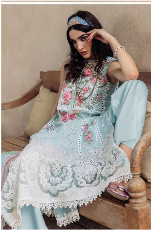
TIME TO shine I love fashion and that's how I express myself