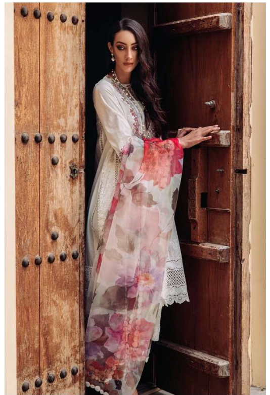
BEAUTY & THE BEAST I love fashion and that's how I express myself