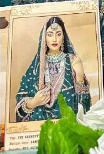
The FOX GEORGET Bottom/Deer: TAN Dupatta: RCT SUIT