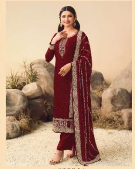
◆ 63604 ◆