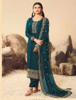
◆ 63602 ◆