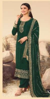
◆ 63608 ◆