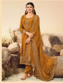
◆ 63603 ◆