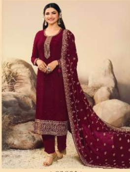
◆ 63601 ◆