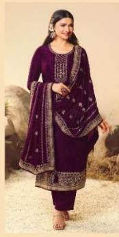
◆ 63607 ◆