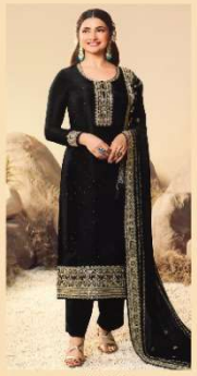
◆ 63609 ◆