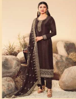
◆ 63606 ◆