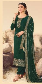
◆ 63608 ◆