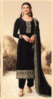
◆ 63609 ◆