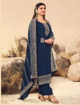
◆ 63605 ◆