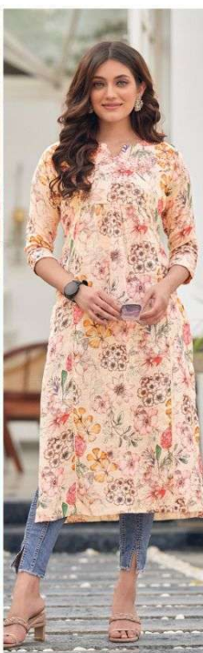
Z - 1154