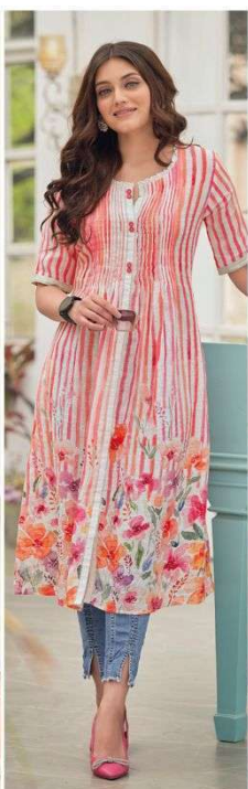
Z - 1153