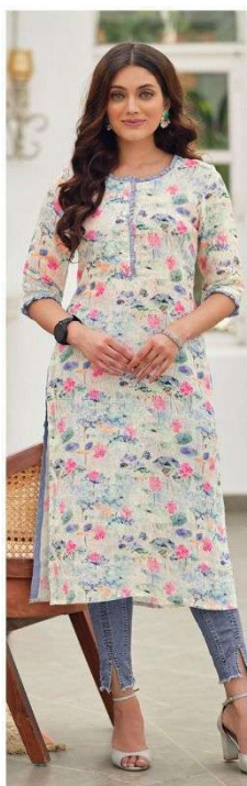
Z - 1152