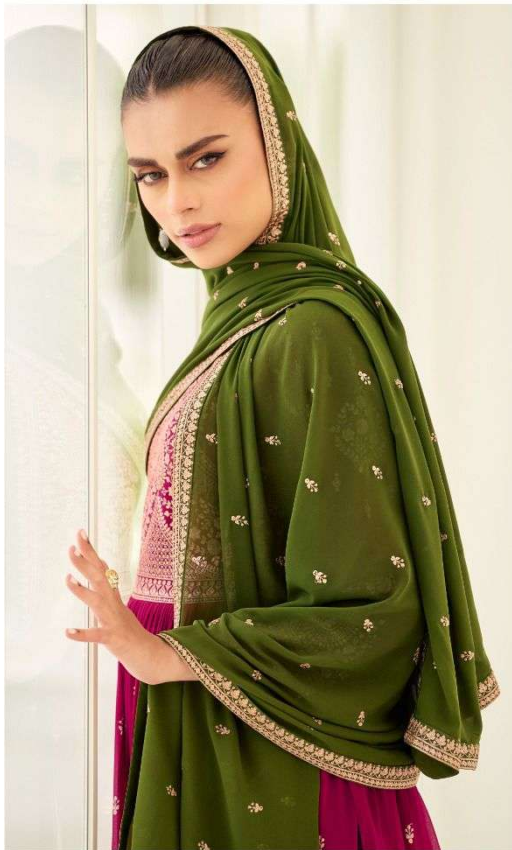
A | - 9659