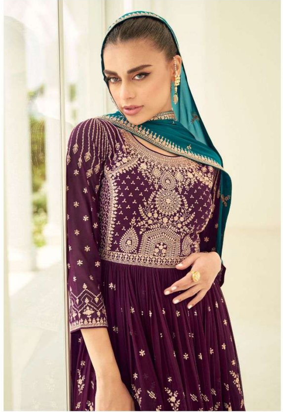
A - 9663