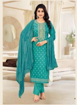
• 18052 •