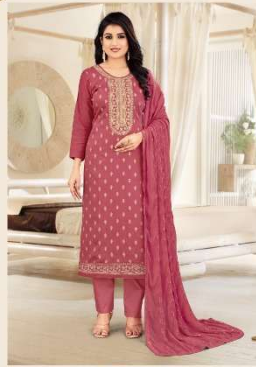
• 18051 •