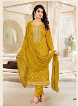
• 18054 •