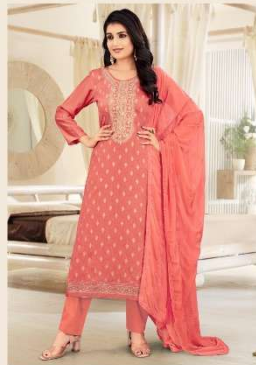
• 18053 •