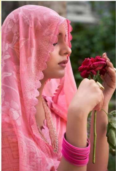
THE NEW MINIMALIST SHOWS HEALING REDS IN A GENTLE SORT OF STYLE, AS THE CULTURE OF LOVE AND MISCHIEF IT BRINGS ON THE (EMOTIONAL) SCENE OF FEARLESS.