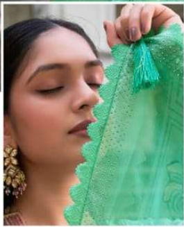
GET YOURSELF THIS SA VARIETY OF PURE ETHNIC WEAR WHICH WILL ATTRACT YOU TO TRADITION, AND MORE DEEP RICH CULTURE WITH A TOUCH OF FINE