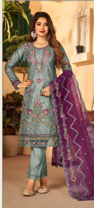
S - 164 B