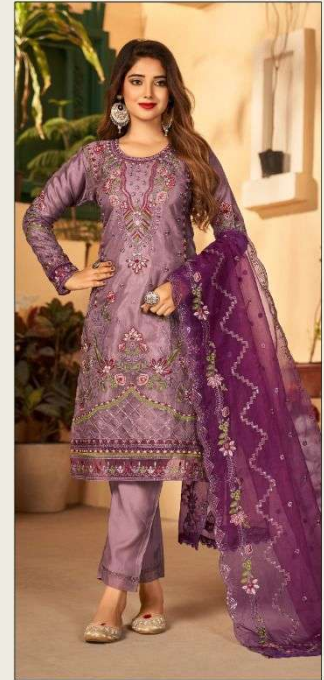
S - 164 D