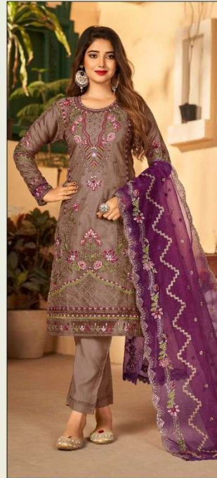
S - 164 C