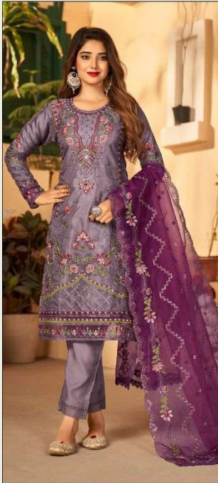
S - 164 A