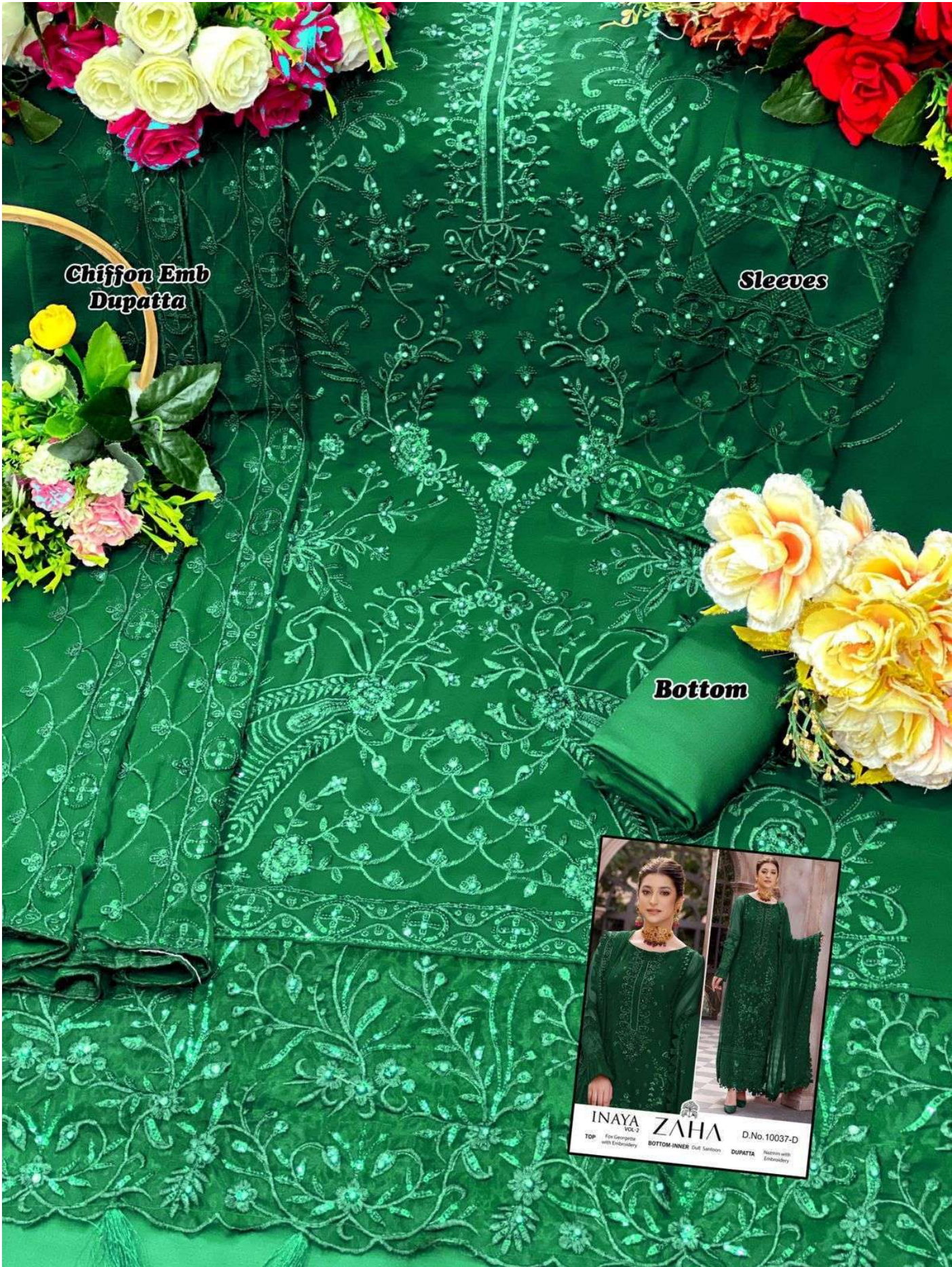
Chiffon Emb Dupatta