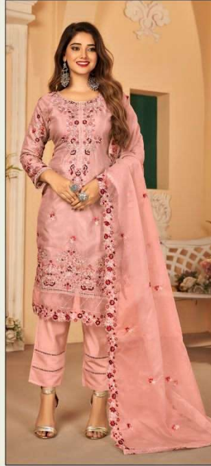
S - 163 C