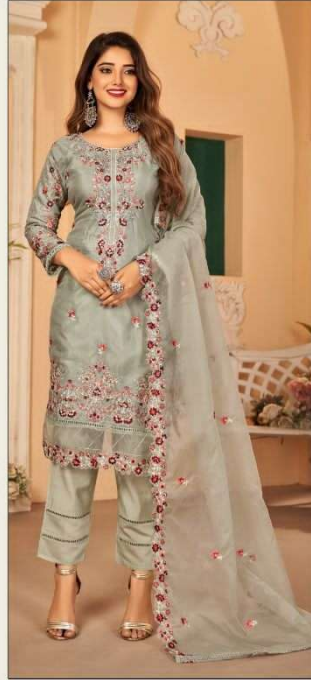
S - 163 B