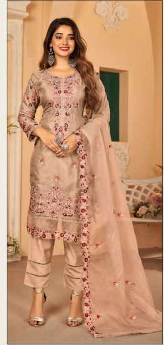
S - 163 D