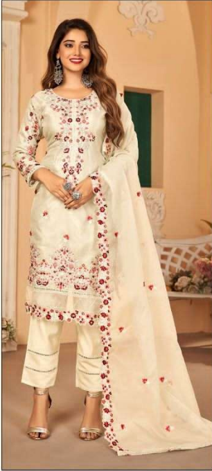
S - 163 A