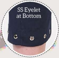
SS Eyelet at Bottom