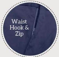
Waist Hook & Zip