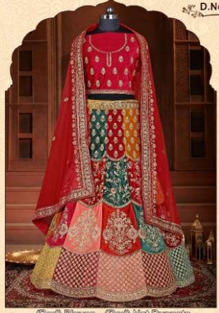
(Red) Blouse - (Red) Net Dupatta