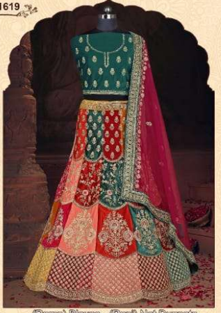
(Rama) Blouse - (Rani) Net Dupatta