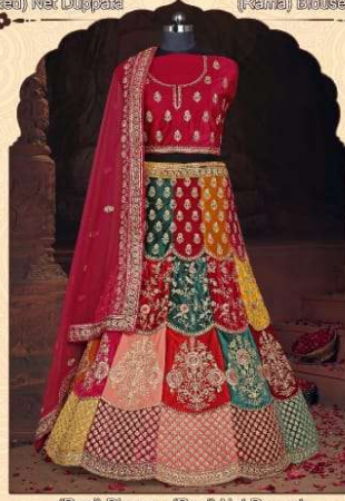
(Rani) Blouse - (Rani) Net Dupatta