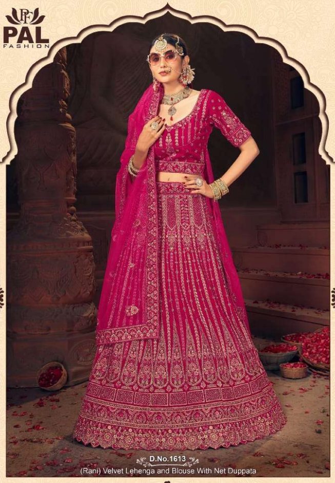
D.No.1613 (Rani) Velvet Lehenga and Blouse With Net Duppata