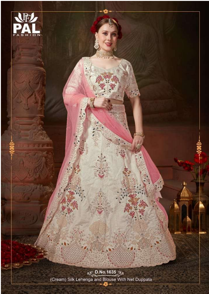
D.No. 1635 (Cream) Silk Lehenga and Blouse With Net Duppata