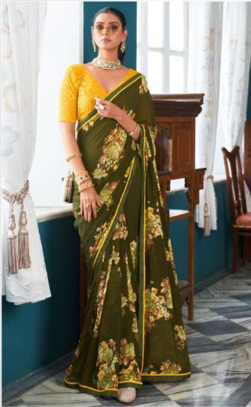
❖ JH /// 105 ❖