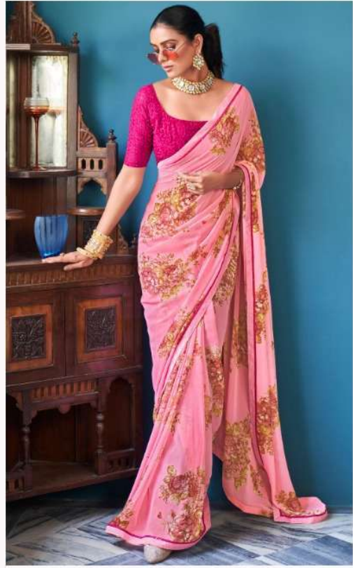
❖ JH /// 102 ❖