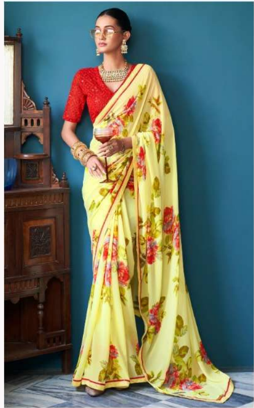
❖ JH /// 106 ❖