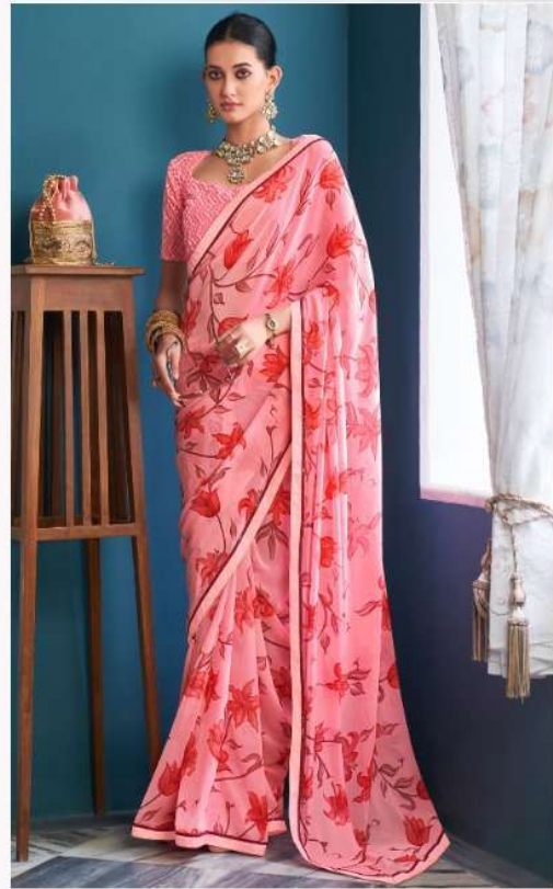
♣ JH /// 104 ♣