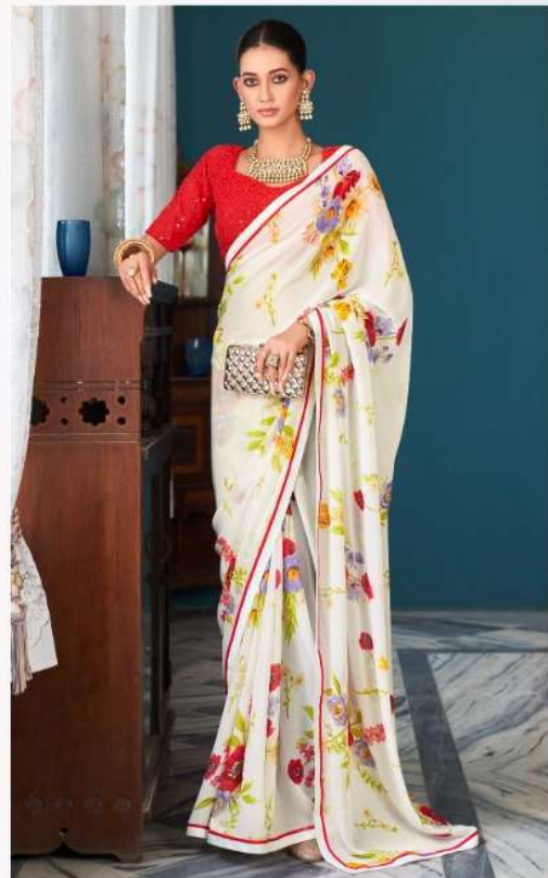
♣ JH /// 108 ♣