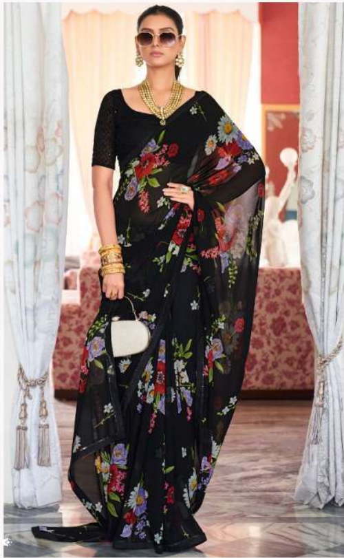
♣ JH /// 103 ♣