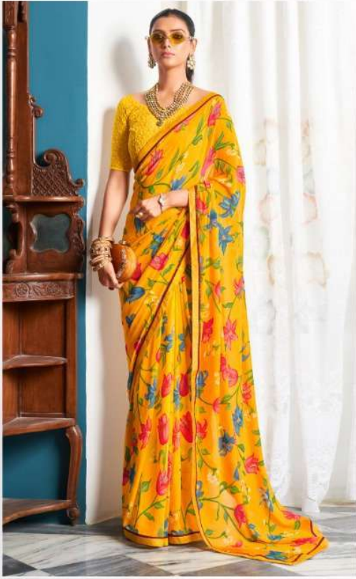
❖ JH /// 101 ❖