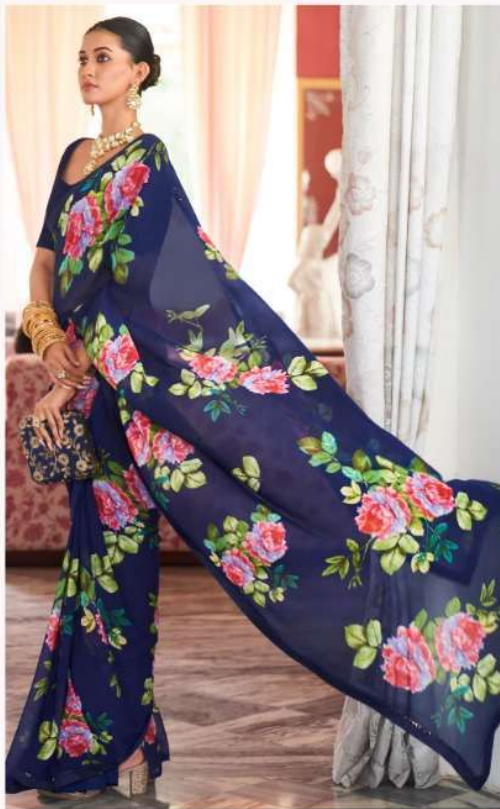
♣ JH /// 107 ♣