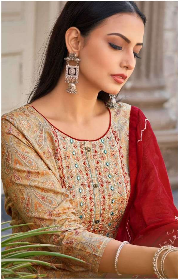
Turn every head your way as you stroll across in outfit from the new Indian cross collection celebrate your classy side with this perfect concoction of chic style.