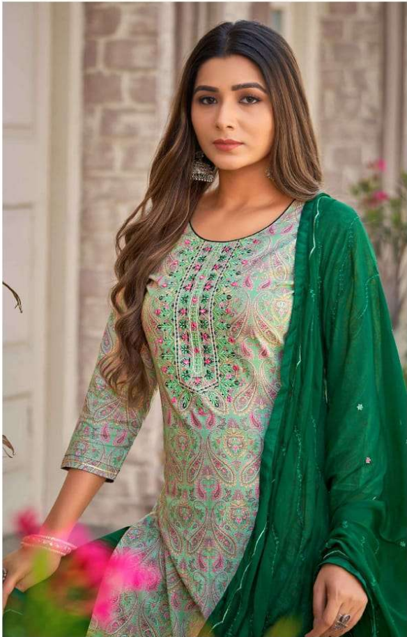
From the fashion archives to correct trend reports the one constant factor is the infibetice of certain countries and ethnicities in designer collection