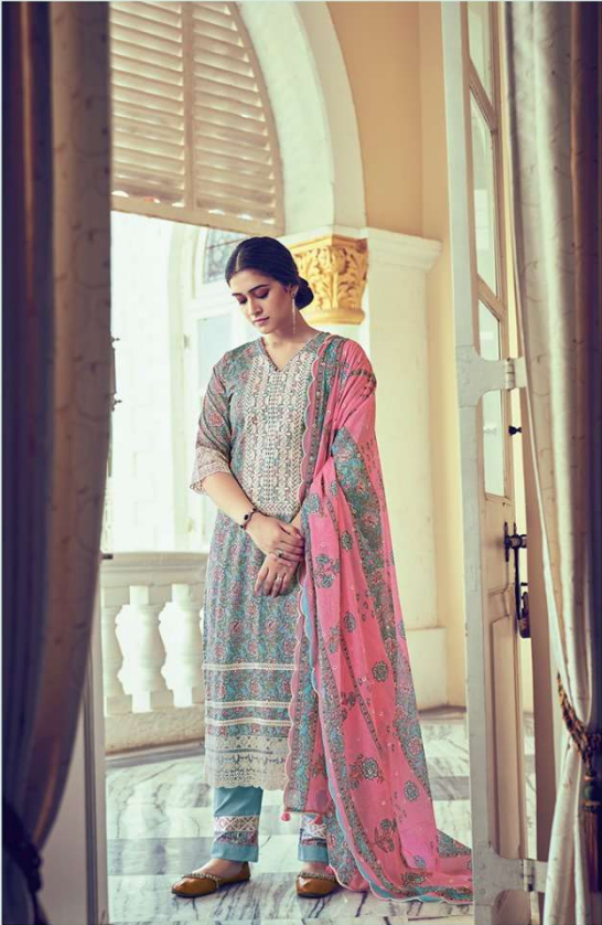
ELEGANT EMBROIDERED contrast ensemble 8206