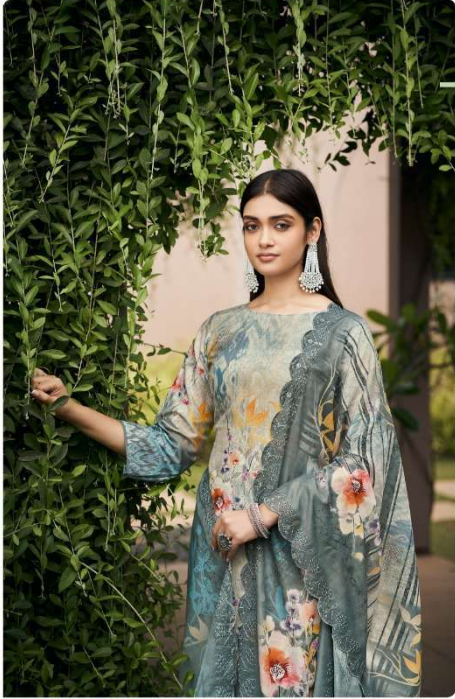
THE SENSE & SENSUALITY Beauty within 176-004