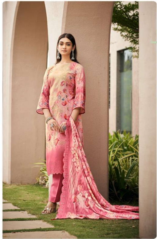
COLLECTION AND HESEMBRIDGE Bright glory 176-003