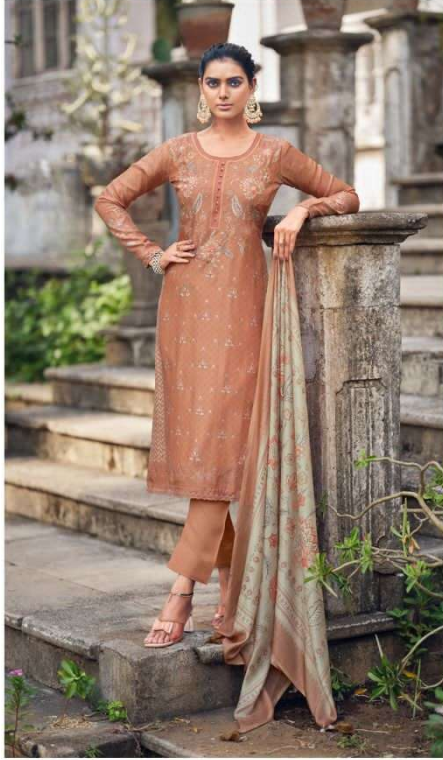
FASHION STYLING 10377