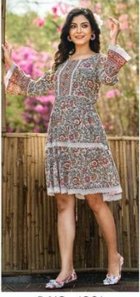
D NO.: 1001