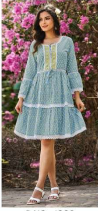
D NO.: 1002