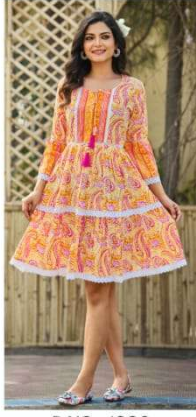
D NO.: 1003