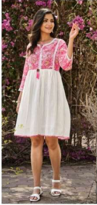
D NO.: 1005