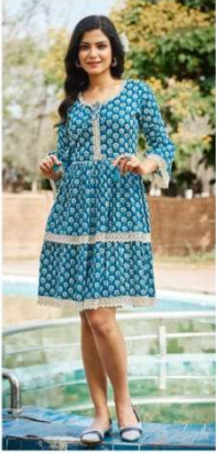
D NO.: 1004