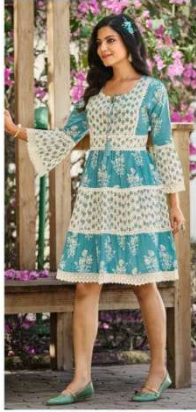
D NO.: 1006