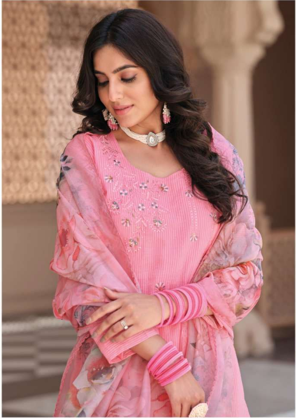
1141 SUMMER OF BEAUTY