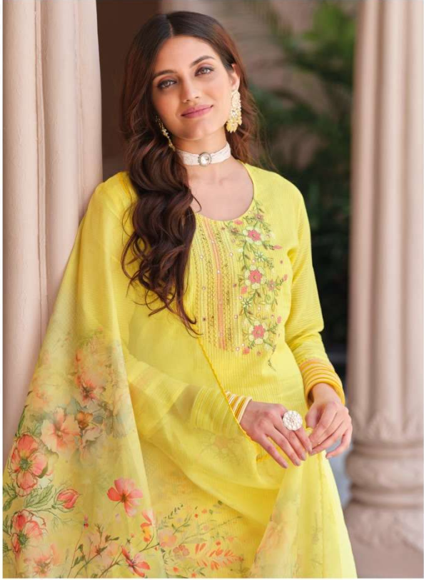
SUMMER OF BEAUTY 1144