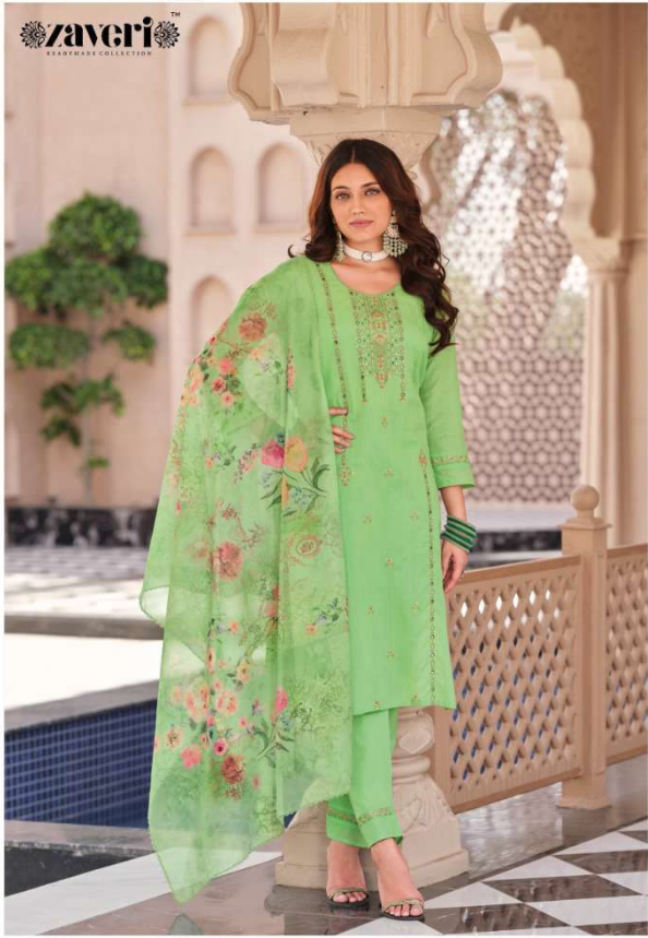
zaveri™ SUMMER OF BEAUTY 1142