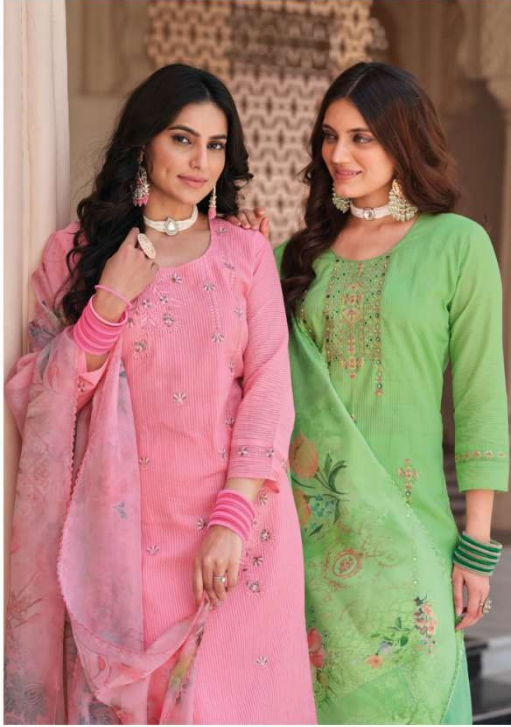
SUMMER OF BEAUTY