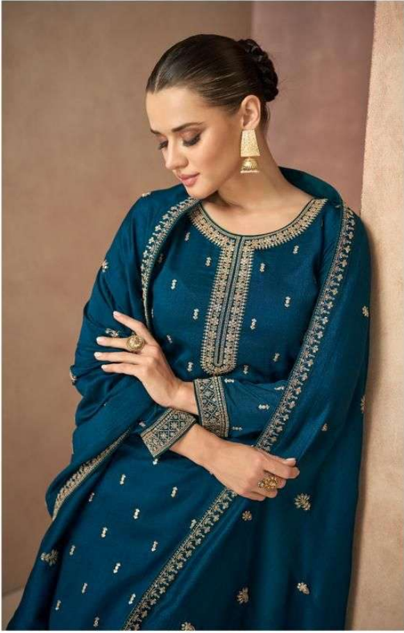
A | - 9565