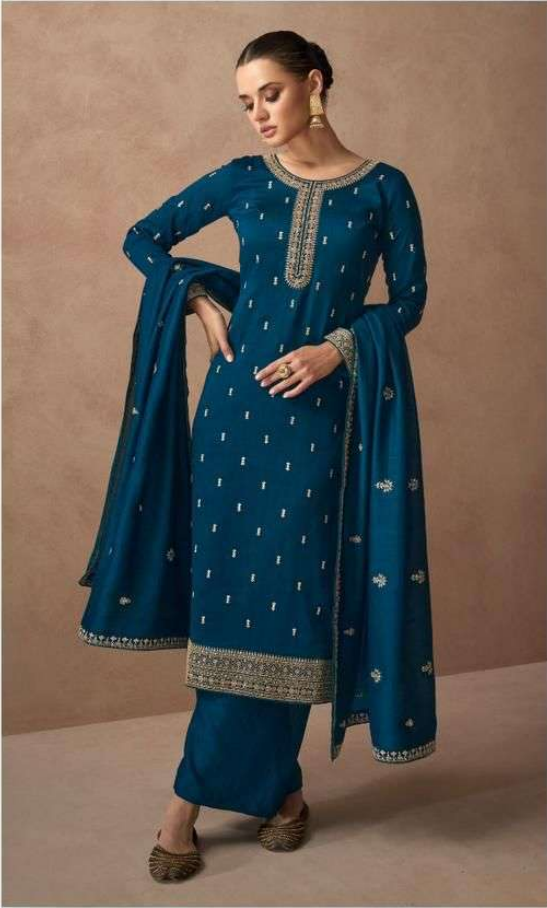
A - 9565