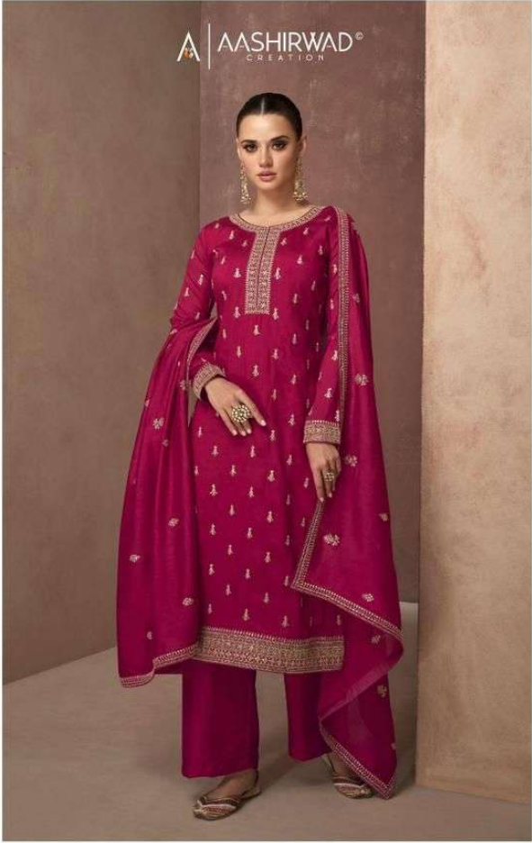
A | - 9567