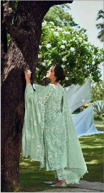
The collection seamlessly creates an ambience of style & grace embellished immaculately with fine work