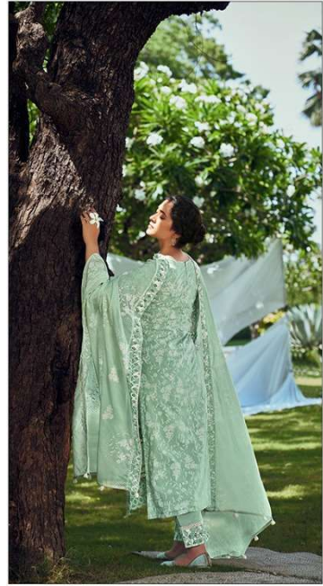
The collection seamlessly creates an ambience of style & grace embellished immaculately with fine work