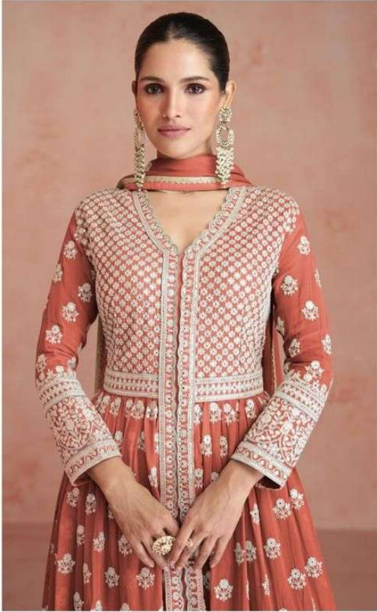
A | - 9599