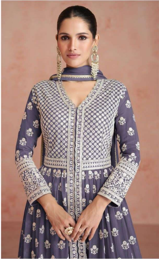
A - 9597