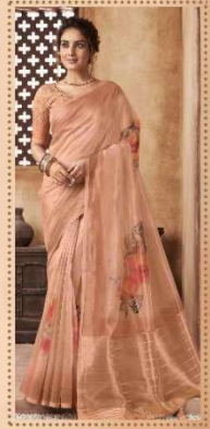
• 3709 •