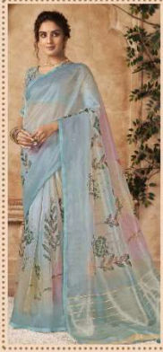
• 3706 •