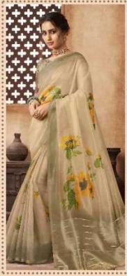
• 3703 •