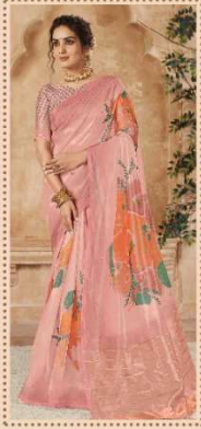
• 3704 •