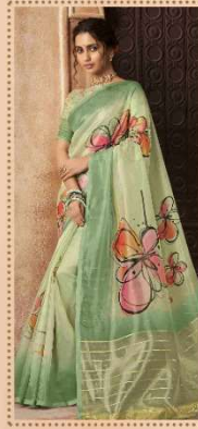
• 3707 •