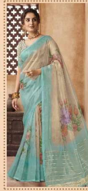
• 3708 •