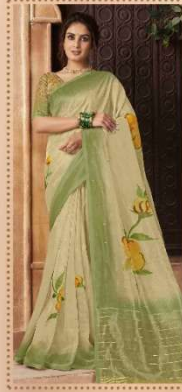
• 3710 •