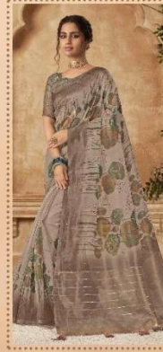
• 3711 •