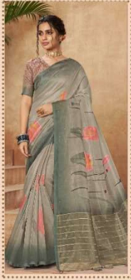
• 3701 •