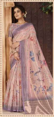
• 3702 •