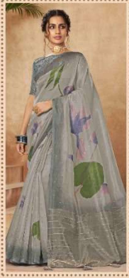
• 3705 •