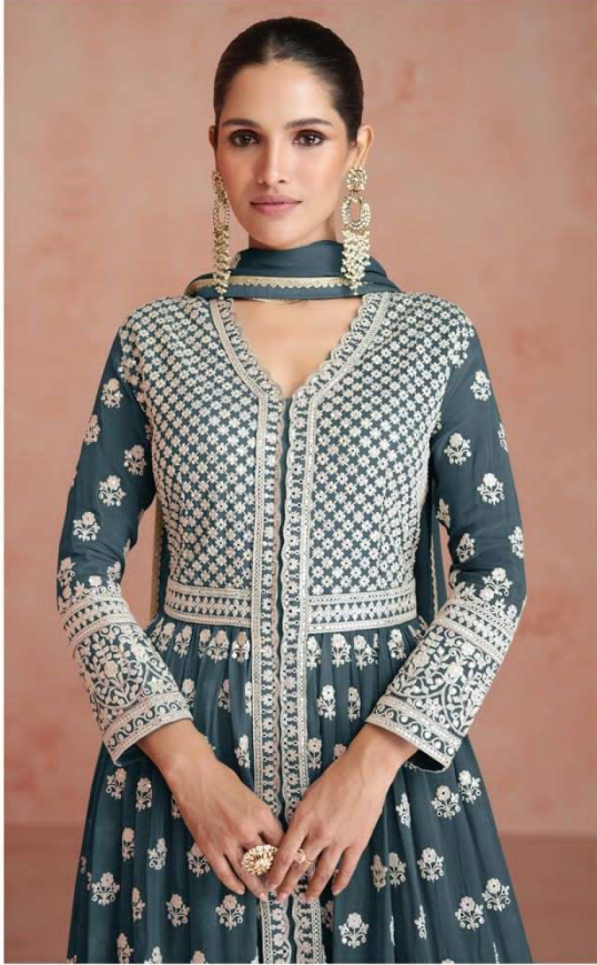
A - 9601