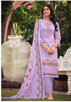
• 781-001 •