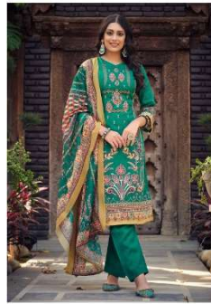
• 781-007 •