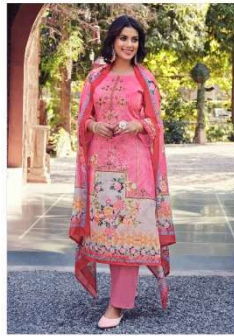
• 781-006 •