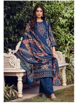
• 781-004 •