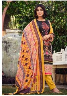
• 781-002 •