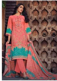
• 781-003 •