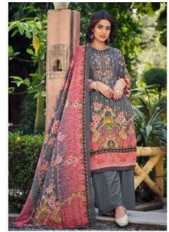
• 781-008 •