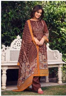
• 781-005 •