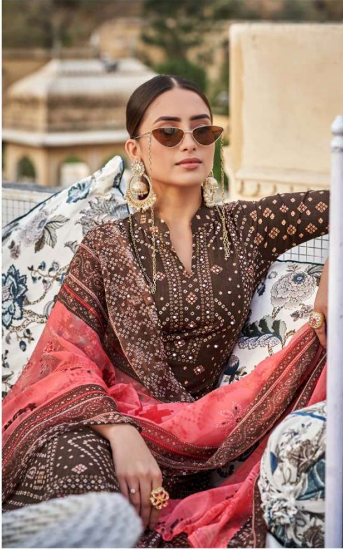
Celebrate your classy side with this perfect Collection of this printed designer style.