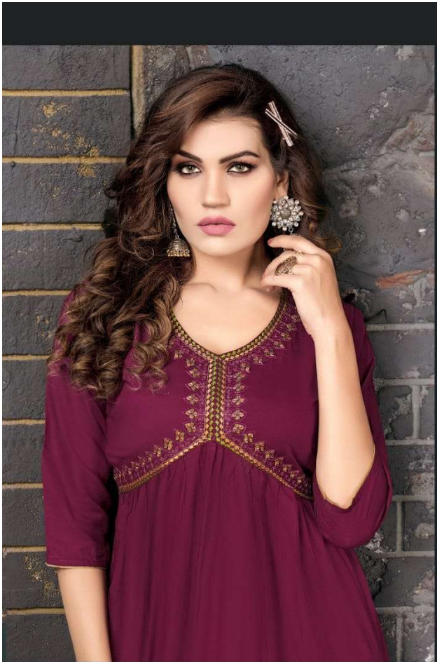
this tradition true gets a whole new look with seductive silhouettes

flights of fancy there is beauty in all things you just need to look close enough. style is a simple way of saying complicated things