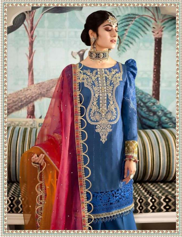
MARIYA B EMBROIDERED FESTIVAL COLLECTION VOL-1