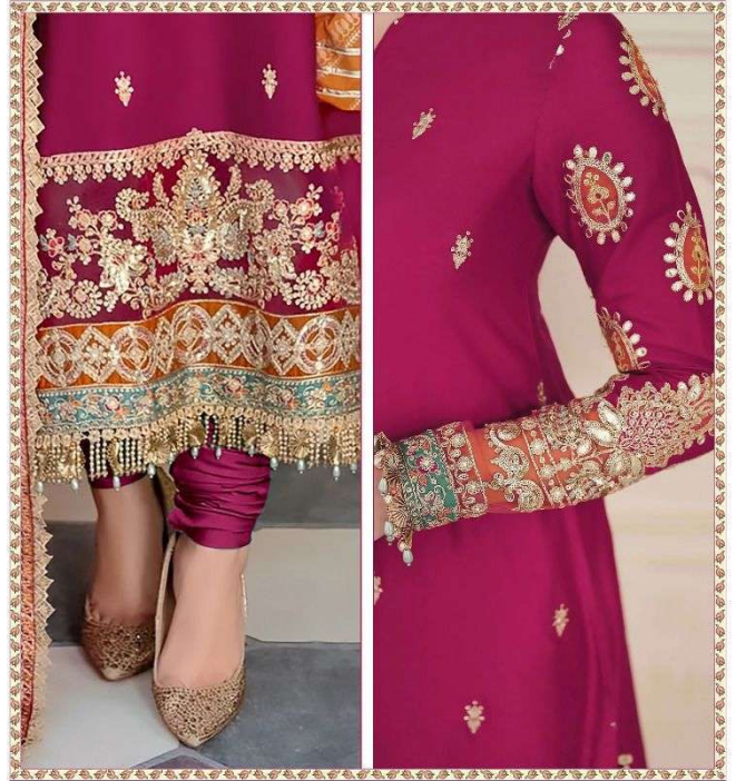
MARIYA B EMBROIDERED FESTIVAL COLLECTION VOL-1