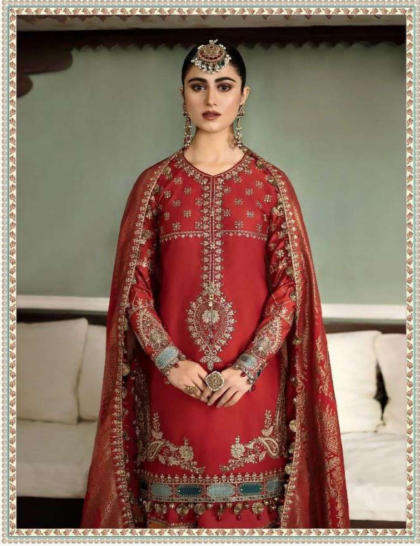
MARIYA B EMBROIDERED FESTIVAL COLLECTION VOL-1