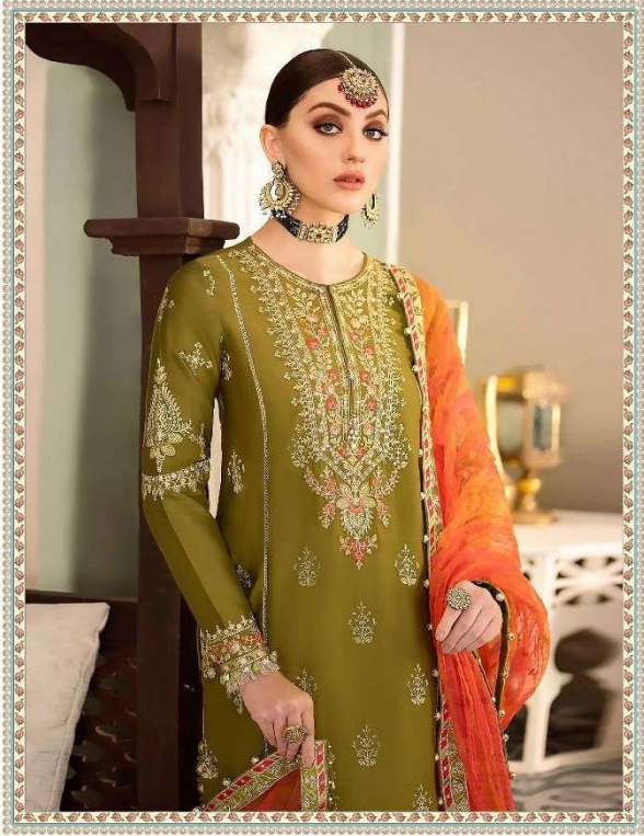
MARIYA B EMBROIDERED FESTIVAL COLLECTION VOL-1