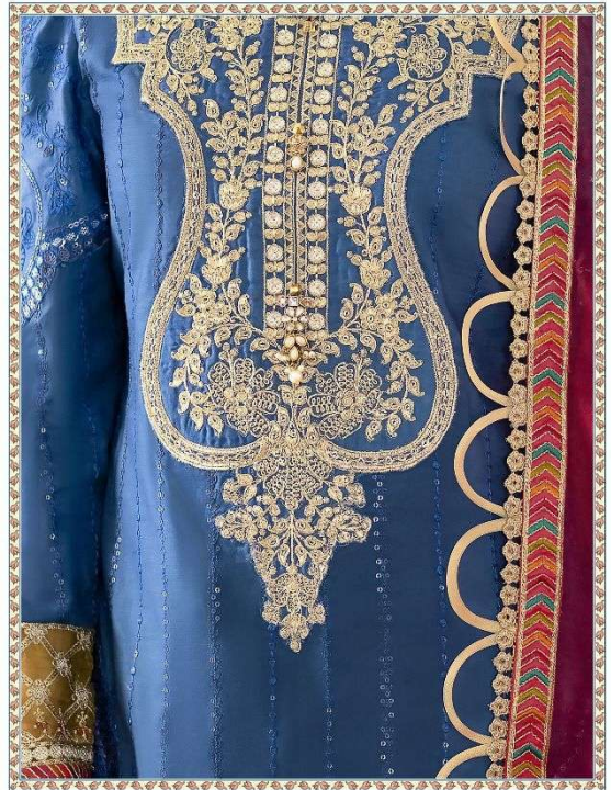
MARIYA B EMBROIDERED FESTIVAL COLLECTION VOL-1