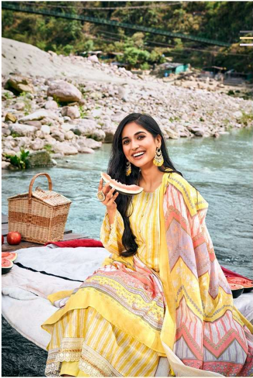
D.NO. 1002 DREAMY DRAPES