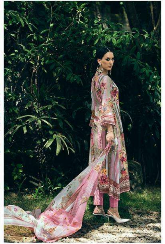
She stands a bird house for its culture, its heritage, its beauty and its untold riches. And yet, with her beauty, her grace and the splendor of her dress, she captures the imagination of the land around her. She is majestic, she is sublime in the stark forest landscape, an image to cherish.