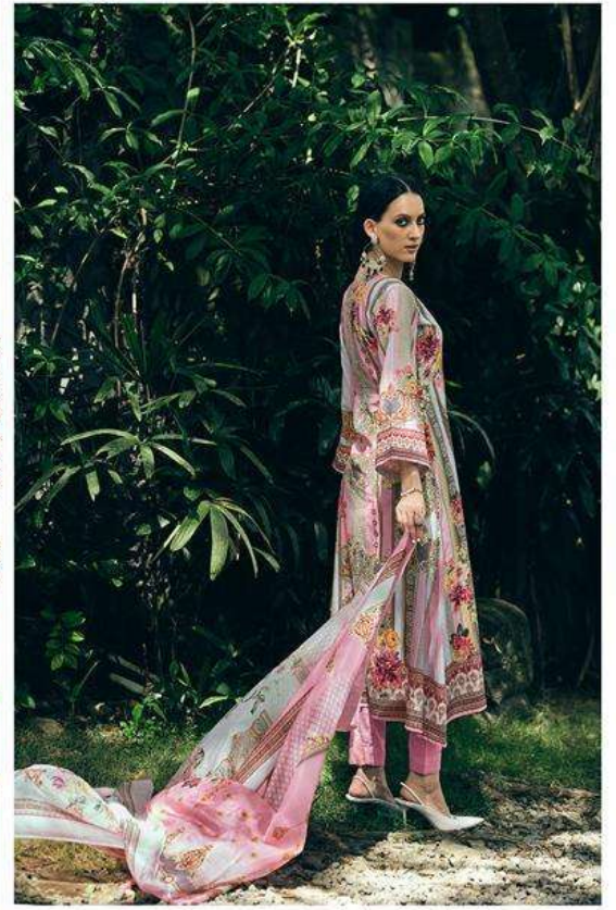
She stands a bird's eye view for its culture, its heritage, its beauty and its untold riches. And yet, with her beauty, her grace and the quality of her skin, she captures the imagination of the land around her. She is majestic, she is sublime in the stark forest landscape, an image to cherish.