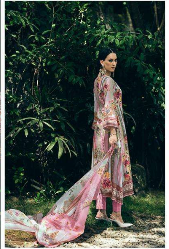
She stands a bird house for its culture, its heritage, its beauty and its untold riches. And yet, with her beauty, her grace and the splendor of her dress, she captures the imagination of the land around her. She is majestic, she is sublime in the stark forest landscape, an image to cherish.