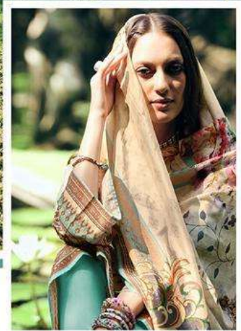
She stands in a land known for its culture, its heritage, its beauty and its untold riches. And yet, with her beauty, her charm and the grandeur of her attire, she outshines the magnificence of the land around her. Clad in majestic blue, she is freshness in the stark desert landscape...an image to cherish.