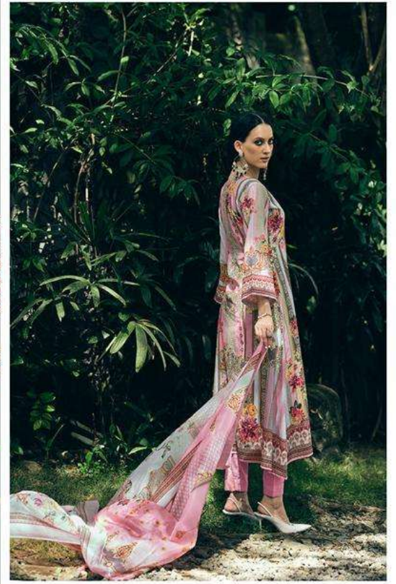
She stands a bird's eye view for its culture, its heritage, its beauty and its untold riches. And yet, with her beauty, her grace and the splendor of her dress, she captures the imagination of the land around her. She is majestic, she is sublime in the stark forest landscape, an image to cherish.