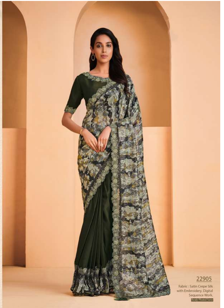
22905 Fabric: Satin Crepe Silk with Embroidery, Digital Sequence Work. www.ayazimam.com