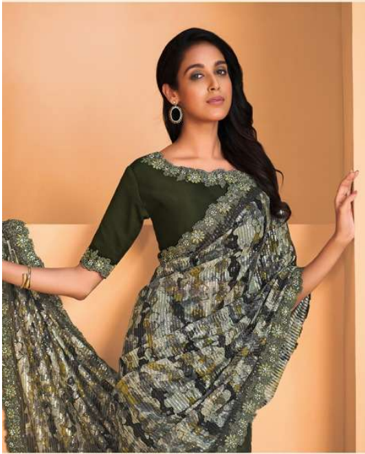
Frolic Splashing Green It is not about dressing according to what's fashionable. You just proved that style is more about being yourself.