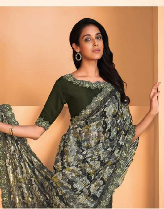
Frolic Splashing Green It is not about dressing according to what's fashionable. You just proved that style is more about being yourself.