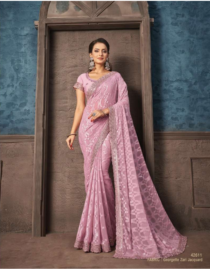
42611 FABRIC : Georgette Zari Jacquard