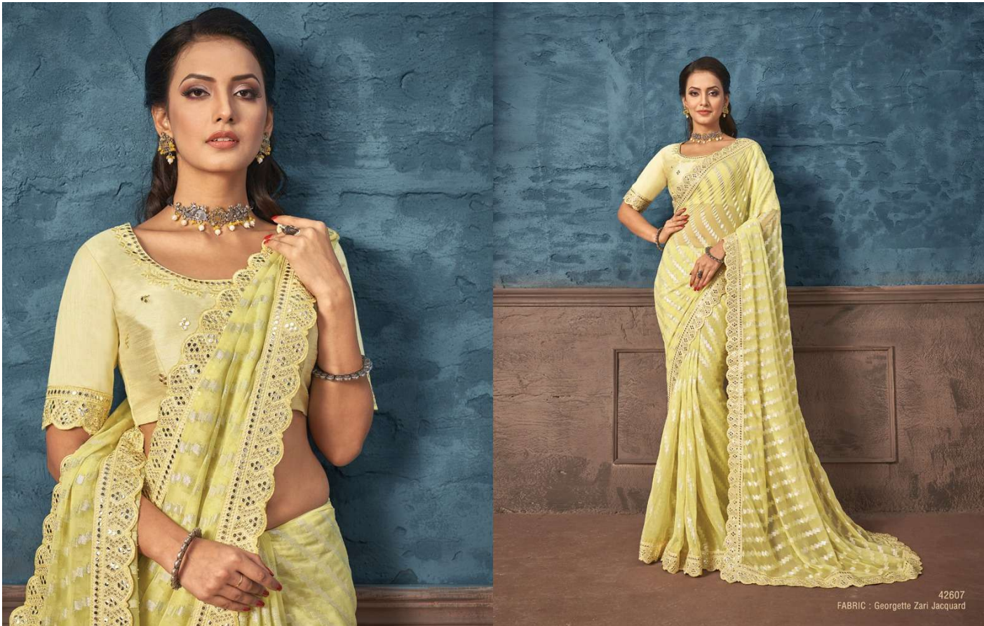
42607 FABRIC : Georgette Zari Jacquard