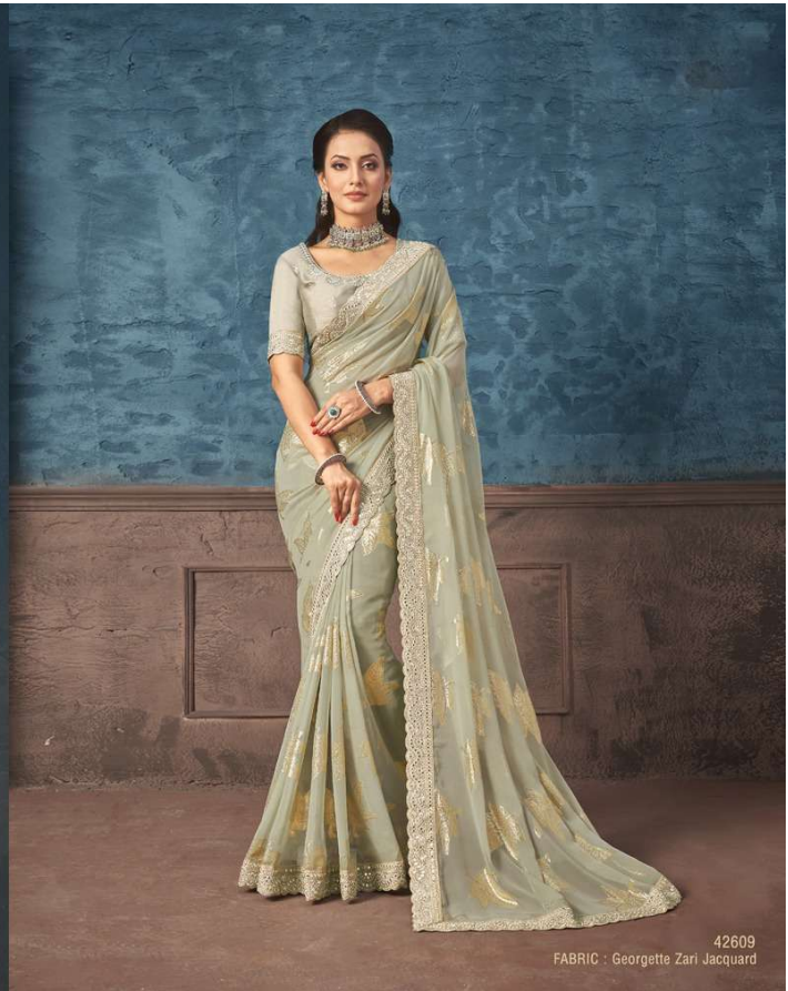
42609 FABRIC : Georgette Zari Jacquard